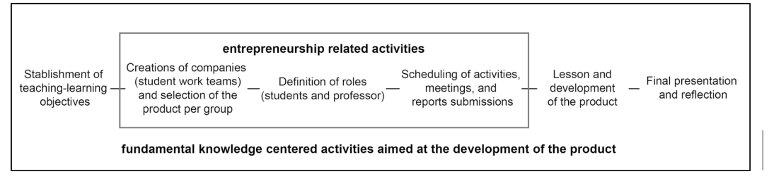
Figure 3. Basic steps of the RAIS strategy.

One of the advantages of the RAIS strategy is that, despite the key and indispensable components necessary for its implementation, and therefore, to ensure the achievement of the objectives, RAIS is a flexible and adaptable strategy, for both the requirements and curricular conditions of the course and the characteristics of the group of students (interests, previous knowledge, expectations, availability of time and resources, ease of access to information, among others). Thus, every RAIS course is based on the following components or steps: establishing clear teaching-learning objectives, organization of the set of companies (work teams), selection of the products to be developed, definition of roles and functions to be fulfilled by both students and the teacher, scheduling activities (product execution plan), meetings and partial reports, and specifying the strategies that will be used for formative and summative evaluation of the process (see Figure 3).