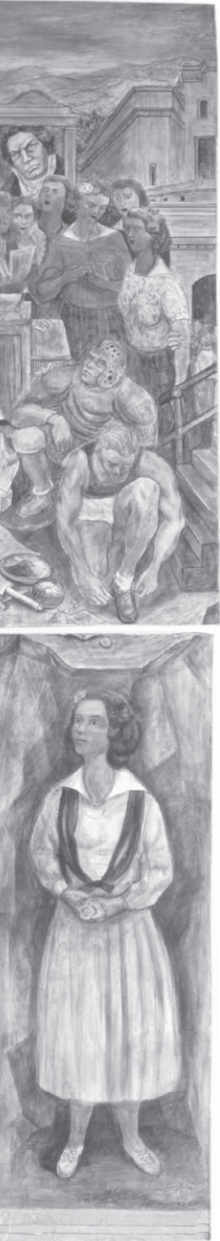
Hideo Noda, central, left and right panels of mural for Piedmont High School, California, 1937, fresco, Kumamoto Prefectural Museum of Art, Kumamoto, Japan.

munist view of art in this period, there was no real space for more nuanced interpretations of agency or meaning for those thinking within the framework of Party discourse. In relation to such thinking, the very complexity and philosophical pretensions of Rivera's imaging of history were likely to prompt critique.