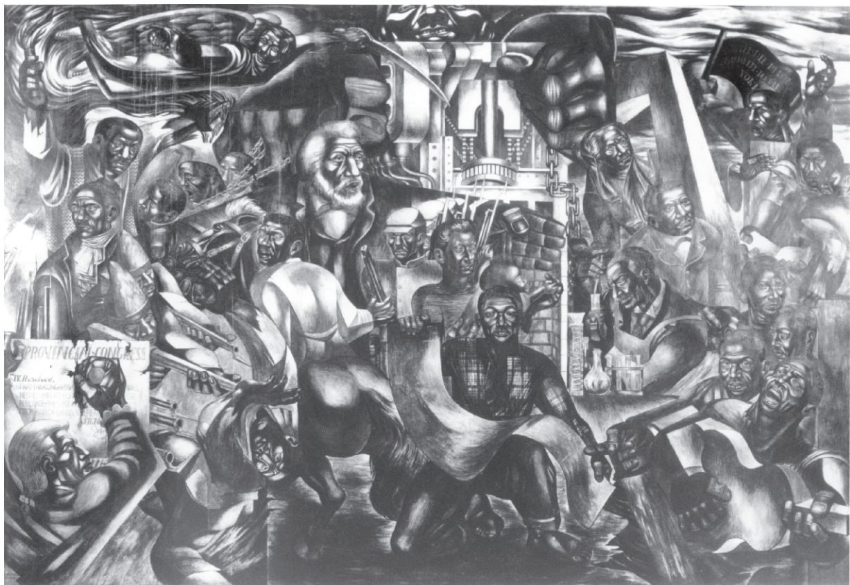
Charles White, The Contribution of the Negro to Democracy in America , 1943, egg tempera, 352.5 x 517.5 cm, Hampton University's Archival and Museum Collection, Hampton University, Hampton, VA.