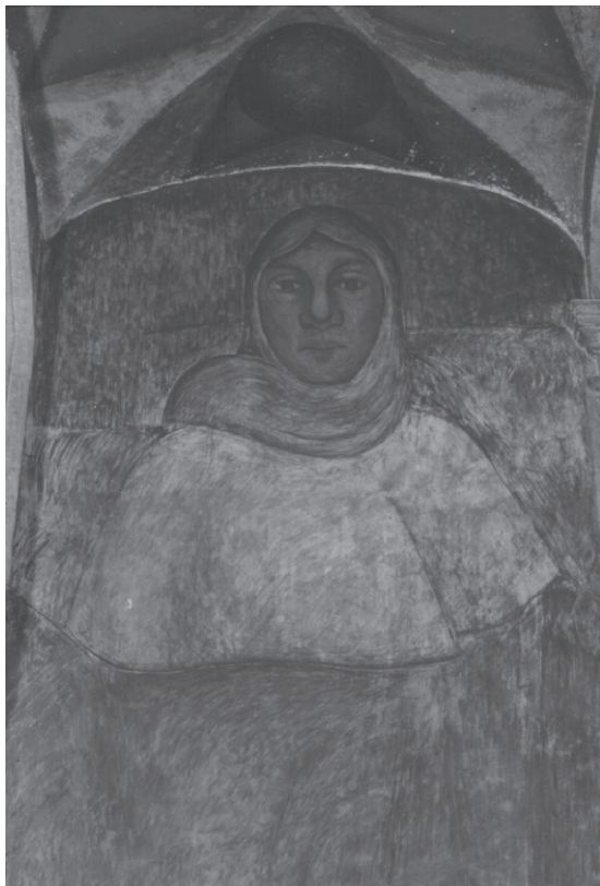
Detalle. Escuela Nacional Preparatoria.

se send us four policemen to keep order in the Institution. A number of discontented students station themselves by the door at 7 P.M., to dissuade their schoolmates from entering". 11