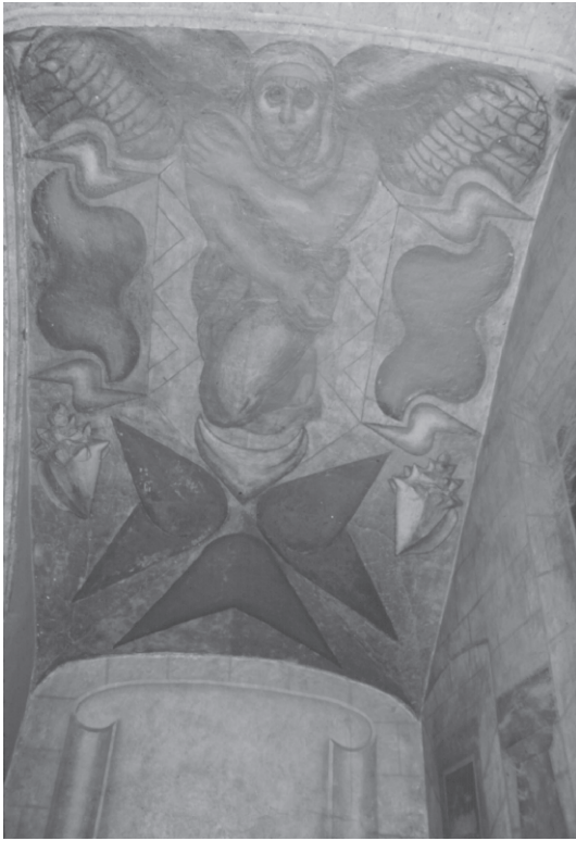
Los elementos, 1922-1923

the building, but he also contributed 300 pesos of his own towards expenses. In turn, Justo Sierra, Secretary of Education managed to add a subvention of 3,000 pesos. 6