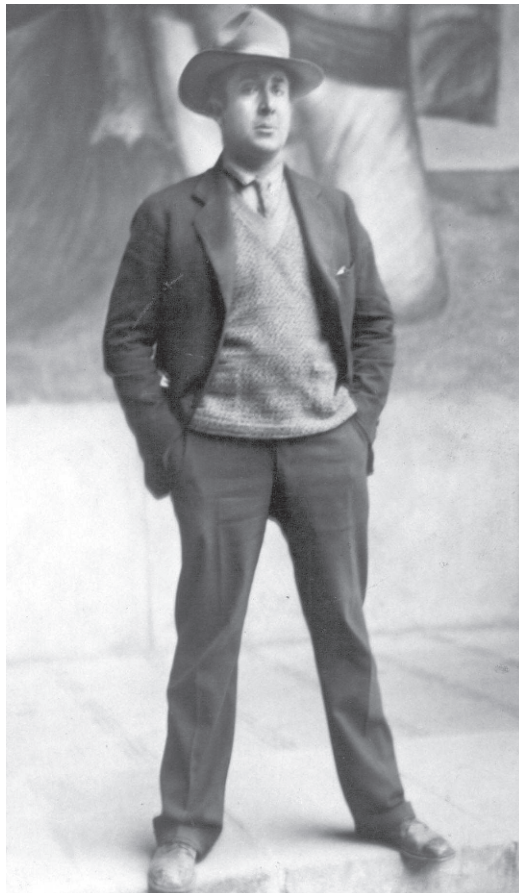
David Alfaro Siqueiros en la Escuela Nacional Preparatoria cuando se constituye la Conferederación Sindical Unitaria de México, 1929.

Young Mexican artists, mostly students of the Academy, were naturally nonplussed. They decided to put up their own display of national art, either totally forgotten or wilfully slighted by the Presidential decree. In the name of the members of the Society of Mexican Painters and Sculptors, Gerardo Murillo –the future Dr. Atl– wrote to Director Rivas Mercado, July 18, asking him for the use of "the classroom of first year of architecture, the exhibition hall, and the corridors of the second floor, to make possible the exhibition