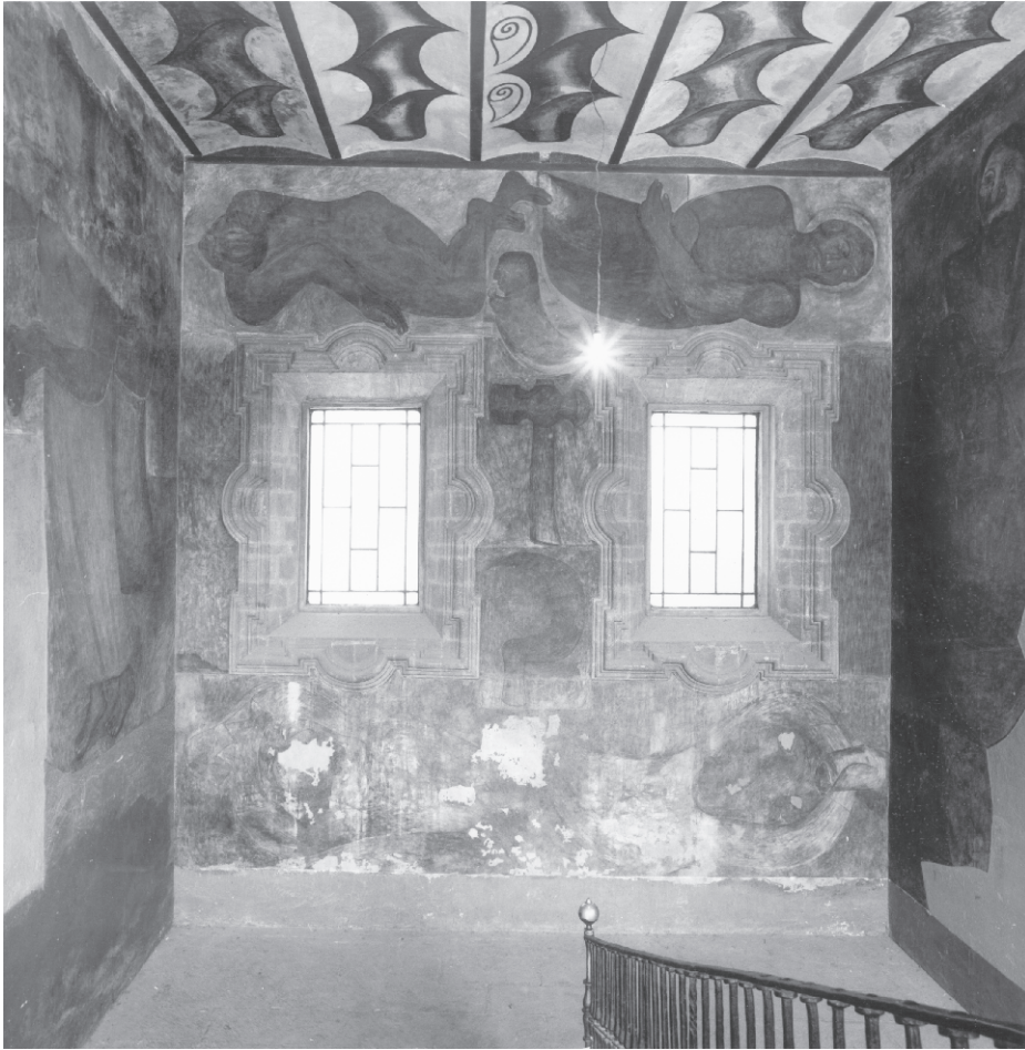
El llamado a la libertad , 1924.

dining-room, bedroom, front room, corridor and garden. A class of painting will be installed there, marking possible the direct study from nature ..., The monthly rental to be 30.00". 20