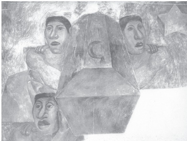
El entierro del obrero sacrificado, 1923-1924. Escuela Nacional Preparatoria.

The last of the circulars that Orozco signed, and thus the last that he presumably read, is No. 17 announcing a faculty meeting to be held June 6, 1923. It is doubtful that he attended it, and probable that from then on, Orozco could have been described by strict bureaucrats as "... arriving late to work or failing altogether to come ... "for, on June 7, he began the fulltime work on the mural decoration of the main patio of the Preparatoria school, having completed the gigantic plan and some of the detailed studies in the little time left between his two clerical jobs.