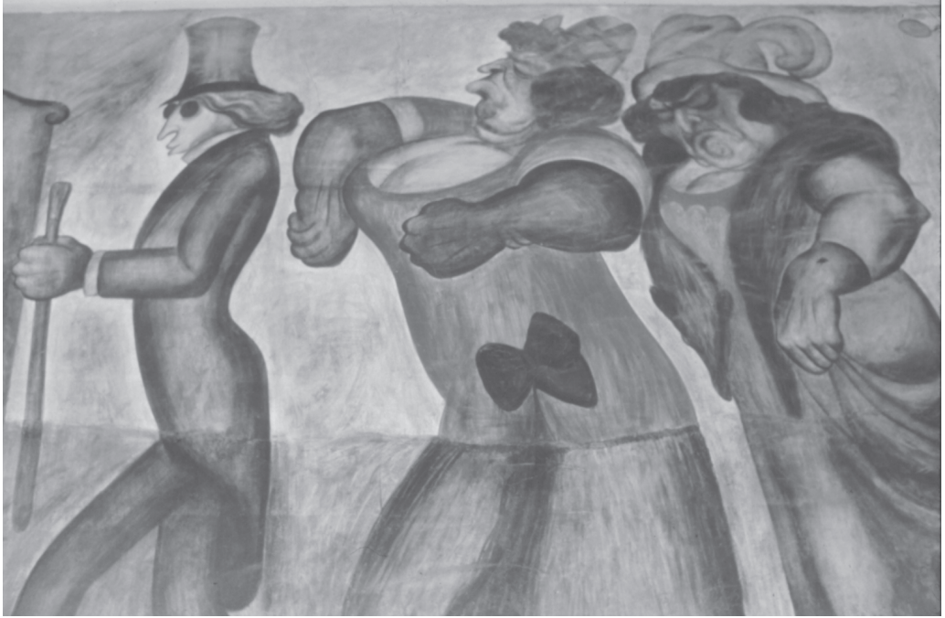
José Clemente Orozco, Fuerzas revolucionarias, 1924-1926. Escuela Nacional Preparatoria.

danger of having to stay in Madrid, where I will arrive in a few days, and in very sharp money difficulties ..."