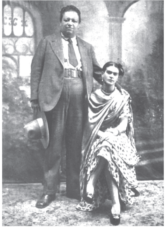
Reprografia, Frida Kahlo y Diego Rivera .