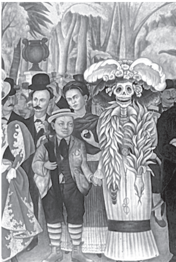
Diego Rivera, Sueño de una tarde dominical en la Alameda Central , 1947, fresco, detalle, Hotel del Prado.

ket, brushes and palette.) By the time she developed her signature self-images mostly painted during the 1940s, Frida had obviously learned to manipulate with greater artistic sophistication the rhetoric underlying her performative status as an exemplar of Mexican cultural identity.