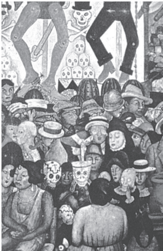
Diego Rivera, Fiesta del Día de Muertos , fresco, Secretaría de Educación Pública.

Rivera's generative role in Kahlo's performance of Mexicanidad is clarified by examining photos and descriptions of her at other points in her life. It is particularly revealing that Frida did not present herself this way before she became involved with Diego (whom she once dubbed "her second accident"), nor during the year they were divorced. Many of her other outfits, however, demonstrate the co-option of equally theatricalized alternative identities. For instance, in several 1926 family pictures taken professionally by her father, Frida in