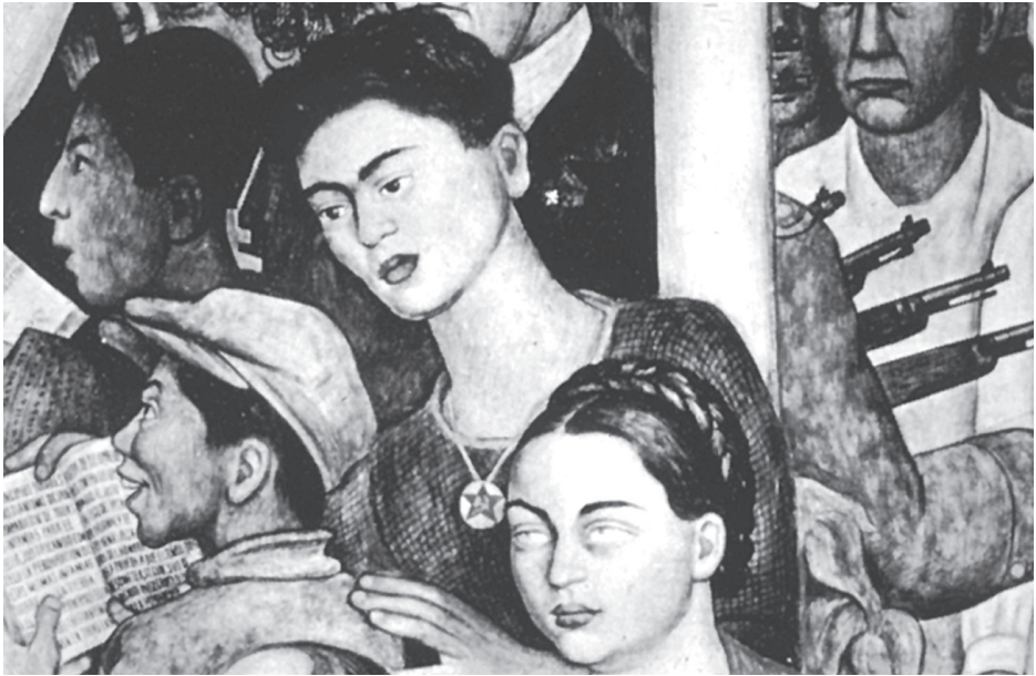
Diego Rivera, La educación obrera, 1929, 1935, 1945, fresco, detalle, Palacio Nacional.

somewhat oddly warned Diego that trouble might lie ahead, as his favorite child was actually un demonio oculto was the bride's only family member to attend. Even he seems to have been confused as to whether this unlikely union was really happening; when he rose and queried those assembled, "Gentlemen, is it not true that we are play-acting?" 21 Guillermo Kahlo quite unintentionally summarized a key component of his daughter and new son-in-law's unusual romance.