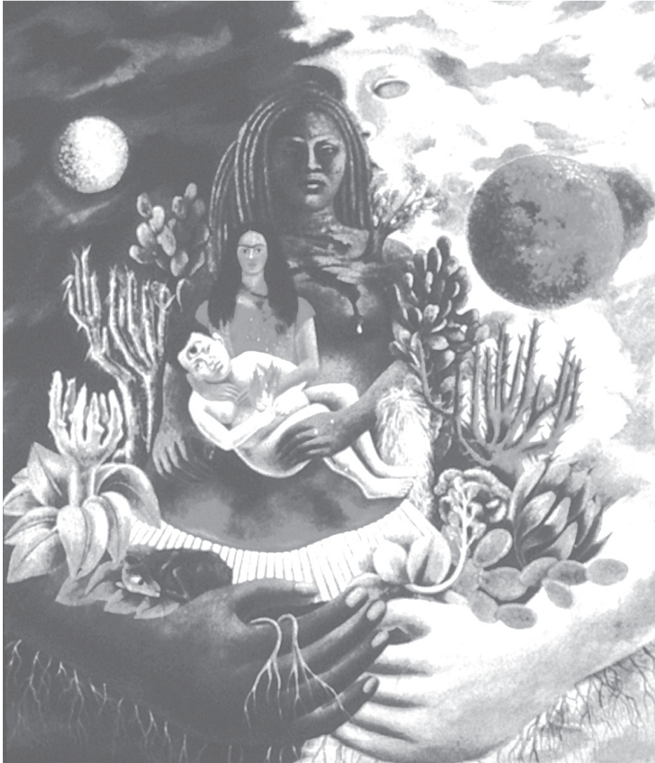
Frida Kahlo. El amoroso abrazo del universo, de la Tierra, Diego, yo y el Sr. Xólotl , óleo sobre masonite, Foto: Archivo Fotográfico Manuel Toussaint/IIE.

holding a message "dedicated with all love"— was probably in retaliation, and indeed Diego, infuriated when