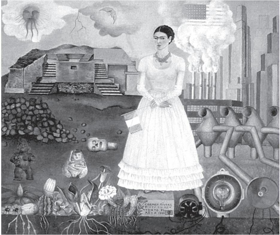
Frida Kahlo, Autorretrato en la frontera entre México y Estados Unidos , 1932, Óleo y collage sobre masonite.

of a child, yet her breasts were well-developed". 5