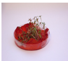
Garden cress exposed to red tattoo ink