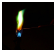
Flame-colouration by a blue tattoo ink