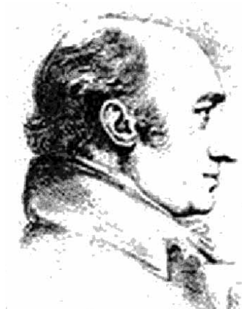
Figure 3. Drawing of Wollaston done with the help of his camera lucida.

form and placing a stop at suitable distance from its concave side. The significance of the distance was that it determined the particular zone of the meniscus through which light passed at a given angle to the lens axis. He first remarked that while the crossed lens of Huygens gave minimum spherical aberration for direct axial pencils and might therefore be suitable for telescope objectives, it gave but mediocre results when used as