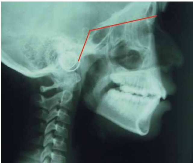
Figure 1. N-S-Ar angle. Measured between N-S and S-Ar planes. It indicates cranial base flexure.