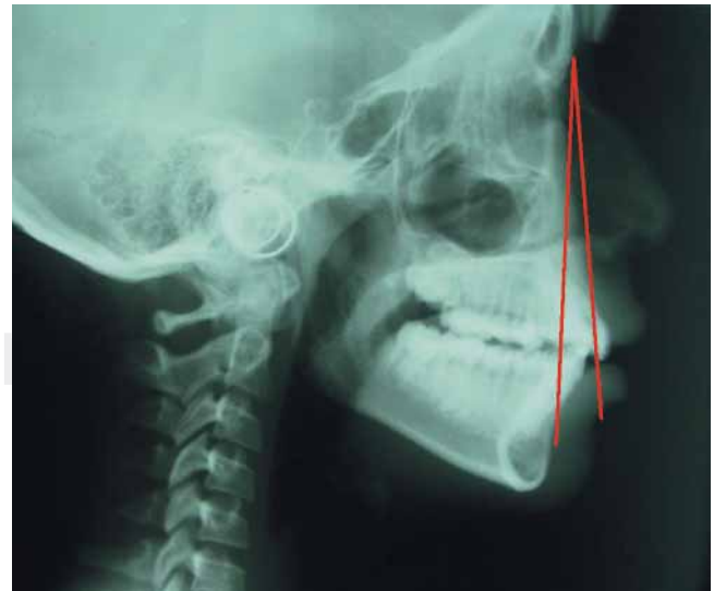
Figure 2. ANB angle, obtained between N-A and N-B planes. It determines skeletal class.