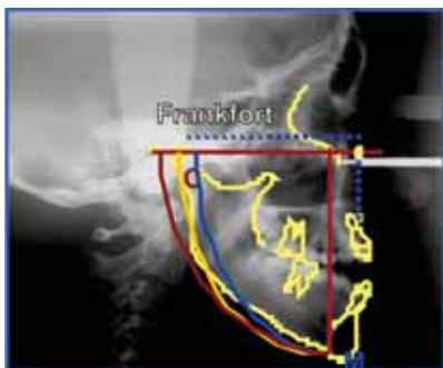
Figure 1. Suborbital facial index.

Bimler facial formula describes the facial pattern by relating three angles. The first one, sub-orbital facial index, identifies the general facial vertical behavior. Sub-orbital facial height is designed as the distance existing between the chin point and the horizontal FH. Facial depth is defined as the distance among FH projections from points A (A') and C (TM). This index is graphically determined by marking the sub-orbital height FH-Me and transferring this measurement with a compass centered in A' for FH (Figure 1). If these markings are found in front of TM the face will be considered as dolichoprosopic or brachyfacial. In cases where markings are found at the TM and the point where the plane is longitudinally cut, we will have a mesoprosopic or mesofacial face. In cases where the markings are found beyond the clivus plane it will be leptoprosopic or dolichofacial face. The second angle is the upper basal angle. This angle is formed by the clivus plane and the palatal plane. (Figure 2) The third angle is the lower basal angle formed by the mandibular plane and palatal plane (Figure 3).