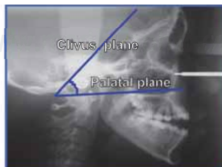
Figure 2. Upper basal angle.