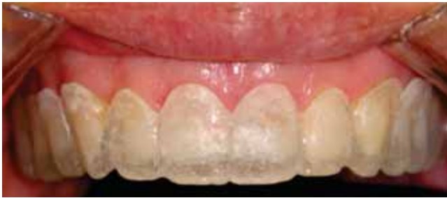
Figure 4. Acrylic surgical guide.