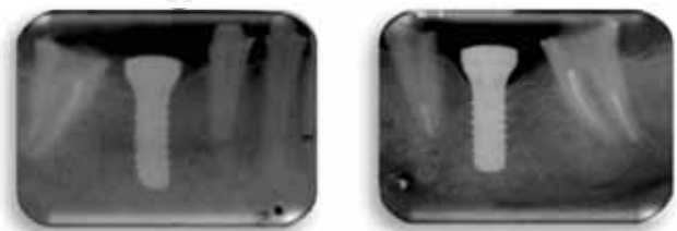
Figure 7. Dentoalveolar X-rays of implants placed in areas of teeth 36 and 46 (Strauman® SP WN Ø4.8 12 mm).