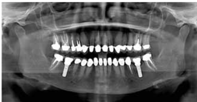
Figure 9. Final panoramic X-ray.

well as implants, require knowledge and application of biological and mechanical principles. 14