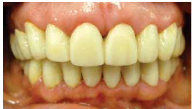
Figure 6. Provisional dentures. Clinical characteristics six months after lengthening the crowns.

Successful combination (amalgamation) of periodontal and restorative procedures, in teeth as