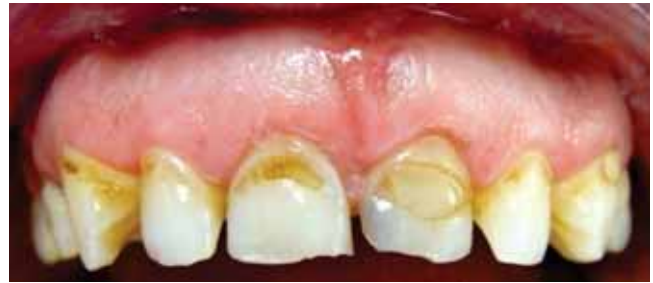
Figure 5. Healing after three months.

At a later point, implants were placed in one single phase (Straumann® SP 4.8 mm WN SLA) in areas of teeth 36 and 46 (Figure 7).