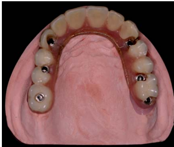
Figure 2. Provisional prosthesis.

when they are splinted with other posterior implants. 19 According to scientific literature, implant-borne maxillary fixed full prostheses are manufactured with an average of six standard-diameter implants. 20 Another important factor in the treatment plan is the relationship between horizontal and vertical planes. The space filled by a crown in an edentulous area varies considerably. If the crown surpasses 15 mm; it indicates that there is vertical loss of alveolar bone and soft tissue. This will entail a problem for fixed restorations. Artificial teeth are elongated, and it is necessary to increase gingival hue in esthetic zones. The longer the shape is, greater will be the impact on the implants, and the more will the force moment increase, therefore, greater will be the risk of a fracture. 21 Based upon the aforementioned data, it was decided to manufacture an upper fixed prosthesis with six implants, zirconia framework and crowns cemented upon it.