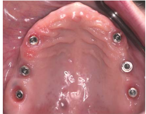
Figure 1. Initial circumstances.

The present article documents the use of zirconia oxide ( \text{ZrO}_2 ) as an option to manufacture frameworks for restorations over implants. The primary objective is the passive fit of the framework as well as inter-phase sealing with the aim of avoiding premature loosening of screws during function, as well as providing long-term