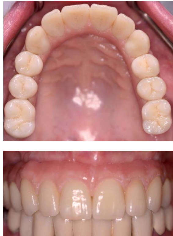
Figure 6. Prosthesis insertion.

Restoration insertion, with the help of X-rays, consisted on confirming the sealing of the appliances on the platform implants applying torque to 35 Ncm screws, obliterating the screw's access, and finally,