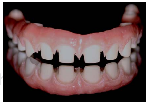
Figure 5. Soft tissue characterization.

with Duralay acrylic resin (Reliance Dental Mfg). Copings had been previously linked and sectioned to decrease distortion. 22 The master model was mounted on a semi-adjustable articulator (Hanau Modular 190,