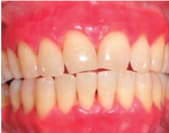
Figure 10. Improvement of oral mucosa lesions.