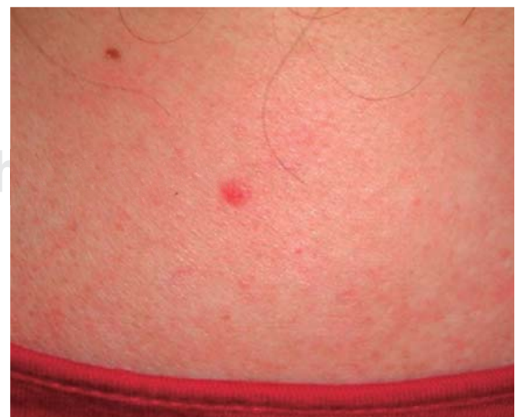
Figure 8. Pustules in high back area.