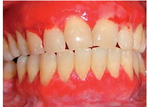
Figure 1. Edematous gingiva with bright red hue and white macules. Alveolar mucosa with white macules. Color picture in: www.medigraphic.com/facultadodontologiaunam

Patient's familial history revealed diabetic, alcoholic father, deceased, mother afflicted with hypertension,