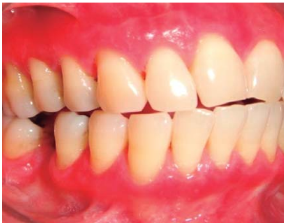
Figure 11. Decrease of white macules in masticatory mucosa. Color picture in: www.medigraphic.com/facultadodontologiaunam