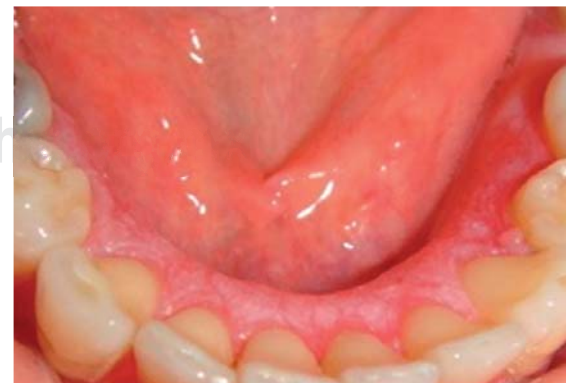
Figure 3. Lingual mucosa with white macules. Color picture in: www.medigraphic.com/facultadodontologiaunam