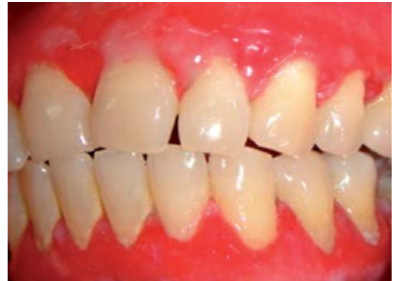
Figure 2. Swollen vestibular oral mucosa with presence of white macules. Color picture in: www.medigraphic.com/facultadodontologiaunam