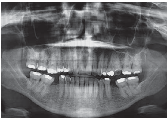
Figure 5. Orthopantomography showing horizontal bone loss in both arches.