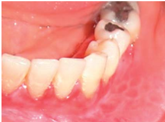
Figure 4. Buccal mucosa with annular-shaped white lesions. Color picture in: www.medigraphic.com/facultadodontologiaunam