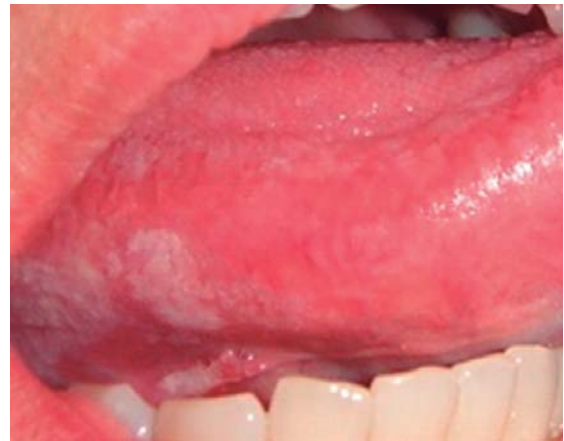
Figure 9. Presence of pseudomembranous Candida albicans in mucosa on borders and ventral side of the tongue.

Treatment plan consisted on substituting enalapril for another anti-hypertensive agent which would not elicit deleterious effects. Valsartan was prescribed (1.5 tablets every 12 hours) and hydrochlorothiazide (0.5 tablets every 24 hours), as well as loratadine (1