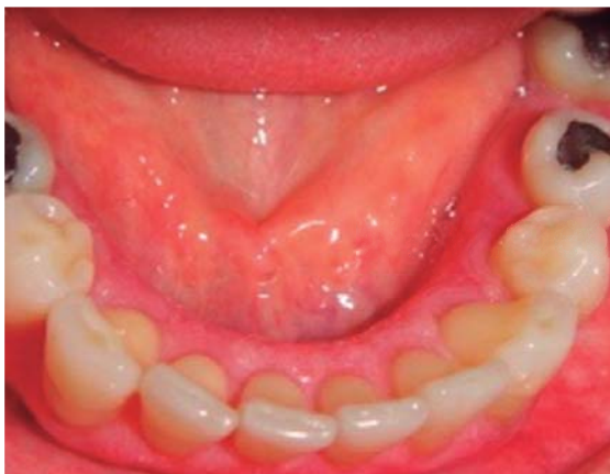
Figure 12. Decrease of white macules in lingual mucosa.

inter-proximal devices, since this is the key to the improvement in periodontal health and will help in the prevention of lesion exacerbation.