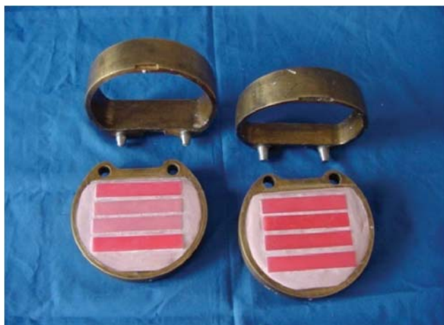
Figure 1. Wax patterns in the muffles with pre-established dimensions.

The present was an experimental study composed of 4 groups of 10 samples each, providing thus a total of 40 specimens. Samples of group «A» were made up with Lucitone 199 acrylic (Dentsply International