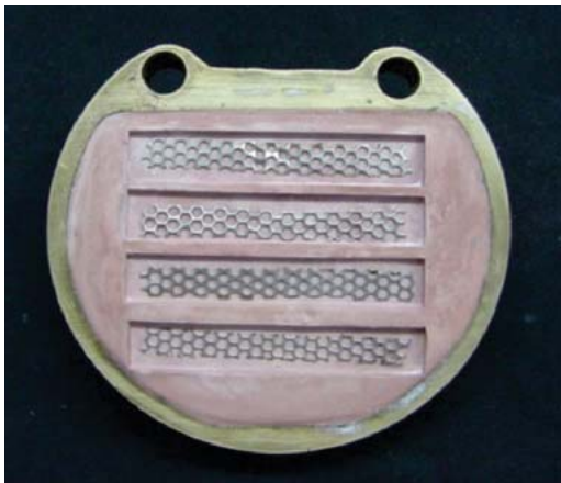
Figure 3. Metallic inserts in the un-waxed areas, or where space was taken by wax pattern ready to be encapsulated in acrylic.