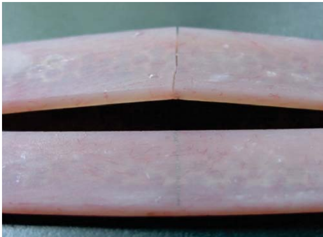
Figure 5. It can be observed that samples fractured after being subjected to a load.