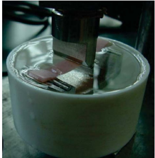
Figure 4. Samples were subjected to loads after having been thermo-cycled for 500 cycles at the Universal > Machine for mechanical tests with a AFTI load cell (Mecmesin, England).

after this, they were left to cool for an additional 15 minutes out of the water. Before undertaking thermo-cycling procedure, samples were immersed in distilled water for 24 hours at constant 37^\circ\text{C} temperature in an oven (Felisa, Mexico). This procedure is called by some authors zero thermo-cycling. 9 After this, they were subjected to 500 cycles in a thermo-cycler at an approximate speed of one cycle per minute, where samples remained in cold water for 20 seconds at a temperature range of 4 \pm 1^\circ\text{C} , and then an additional 20 seconds in hot water at 55 \pm 1^\circ\text{C} . This procedure was devised to simulate changes experienced by the acrylic materials placed inside the mouth when subjected to feeding processes. Samples were subjected to cross-sectioned (transverse) deflection test. This test was conducted in a universal mechanical test machine with an AFTI charge cell (Mecmesin, UK) which has been previously been calibrated to exert constant pressure, beginning with 14.71 N (1,500 g) from zero to one minute, increasing the load during the second half of the next minute to 4.90 N (500 g). The load was applied to three points, one at the center of the sample, 0.01 mm, and lateral points at a 50 \text{ mm} \pm 0.025 \text{ mm} distance. The central point was equidistant to the other two. Loads were applied until the samples fractured (Figures 4 and 5).