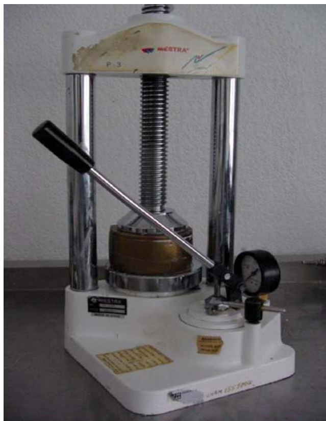
Figure 2. Press used in the study where acrylic mix was pressed at 10 lb/in 2 .

Milford Delaware), this group did not have metallic inserts. Samples of group «B» were made up with Lucitone 199 acrylic (Dentaurum, Pforzheim, Germany), this group did have metallic insert. Samples of group «C» were made up with ProBase Hot acrylic (Ivoclar Schaan Liechstenstein) without metallic inserts. Samples of group «D» were made up with ProBase Hot acrylic with metallic inserts. All samples measured 10 mm wide x 65 mm long and 2.5 mm thick, in compliance with point 4.3.5 of ADA's number 12 specification 10 for polymers used for denture bases.