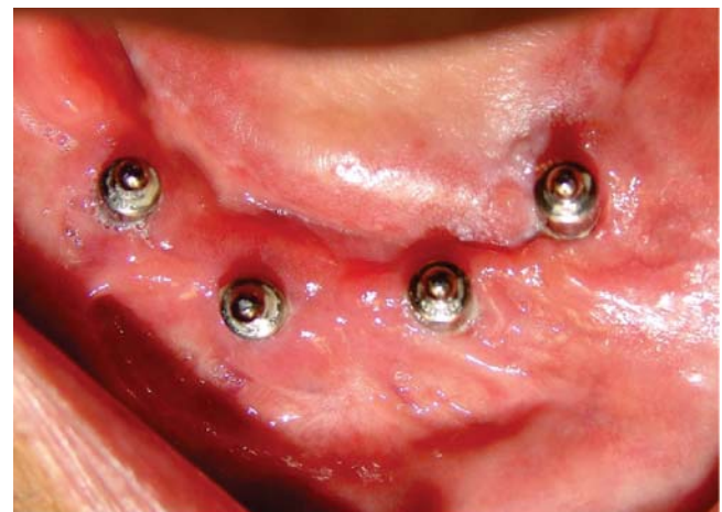
Figure 6. Implants and prosthetic appliances in position.