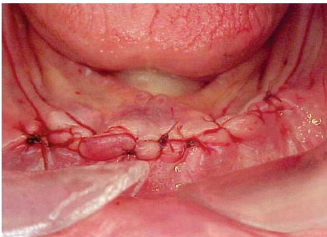
Figure 4. Suture of surgical wound.

of 90 minutes at 2.4 ATM pressure, 100% oxygen (mono-seat hyperbaric chamber, Sechrist Industries Inc, 2820 Greta LN, Anaheim, CA) before implant placement. Ortho-pantomographic X-ray image revealed an appearance of residual alveolar ridge of normal characteristics ( Figure 2 ).