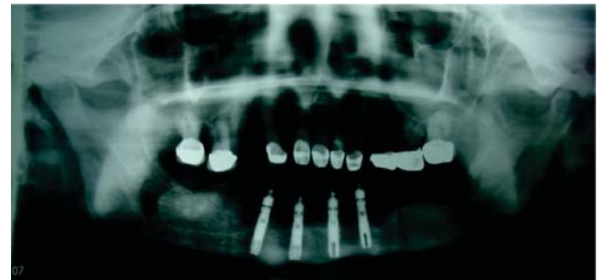
Figure 5. 2 year follow-up orthopantomography after rehabilitation.

At a two-year follow-up period, the patient was satisfied with the results. The patient did not experience signs of inflammation around the implants