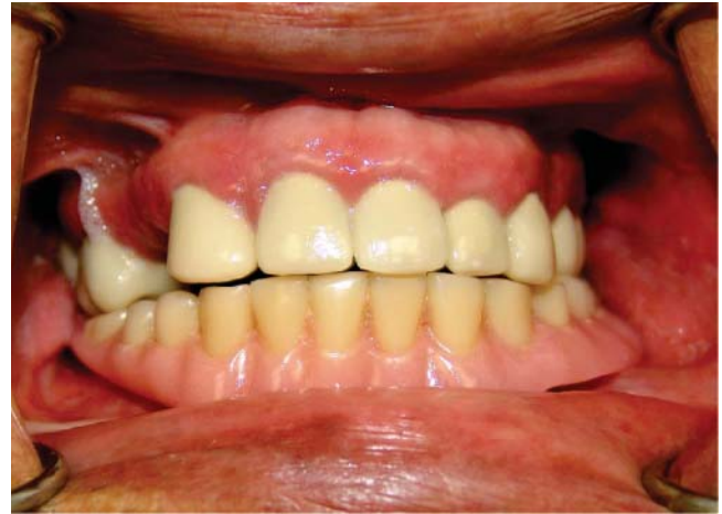
Figure 8. Rehabilitation frontal view.

The most challenging reconstructive endeavor is found in patients afflicted with tissue defect resulting