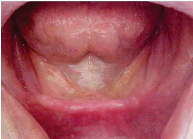
Figure 1. Preoperative clinical image.

It was decided to undertake hyperbaric oxygen protocol. Protocol consisted of 20 daily sessions